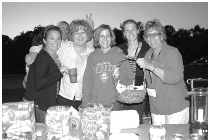
Our 2012 event team - we love our volunteers!

There's plenty to be done both before and during the event - and we'd love to get more members involved!